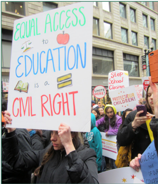
EDUCATIONAL EQUITY PROJECT HIGHLIGHT

THE EDUCATIONAL EQUITY PROJECT strives to prevent, reduce, and eliminate the known disparities in educational resources that burden low-income and minority communities in the Chicago area.