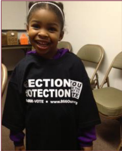
Our youngest Election Protection volunteer